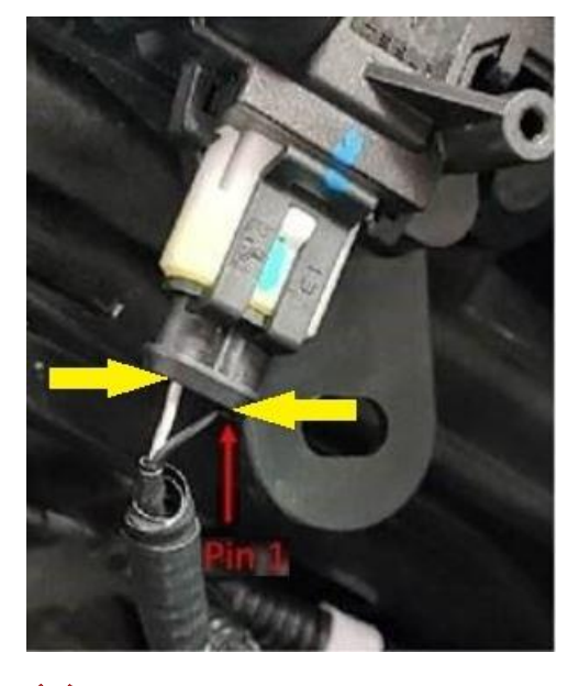
Figure 3 – Incorrect wire position